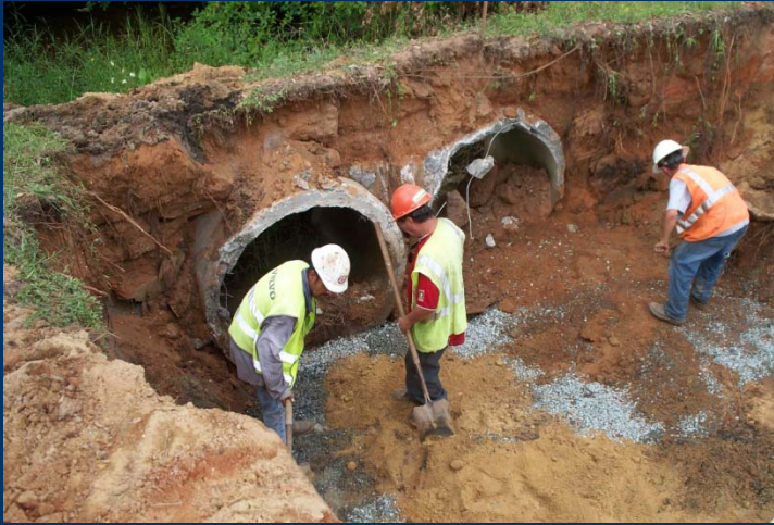
Anderson Columbia crews work on drainage on State Road 87 project.